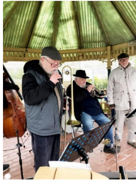
THE SKIDADDLE GROUP